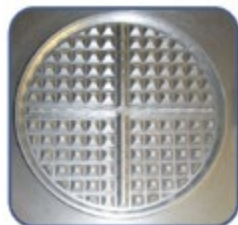
Design 01 (Round)

Model : BW - 01 Plate Size : 230 x 230 Electrical : 220v, 1.5 Kw Capacity : 30 Waffle/Hr (max) Weight : 25 Kgs net