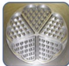
Design 02 (Heart)