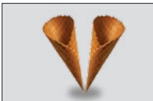
Rolled Sugar Cone