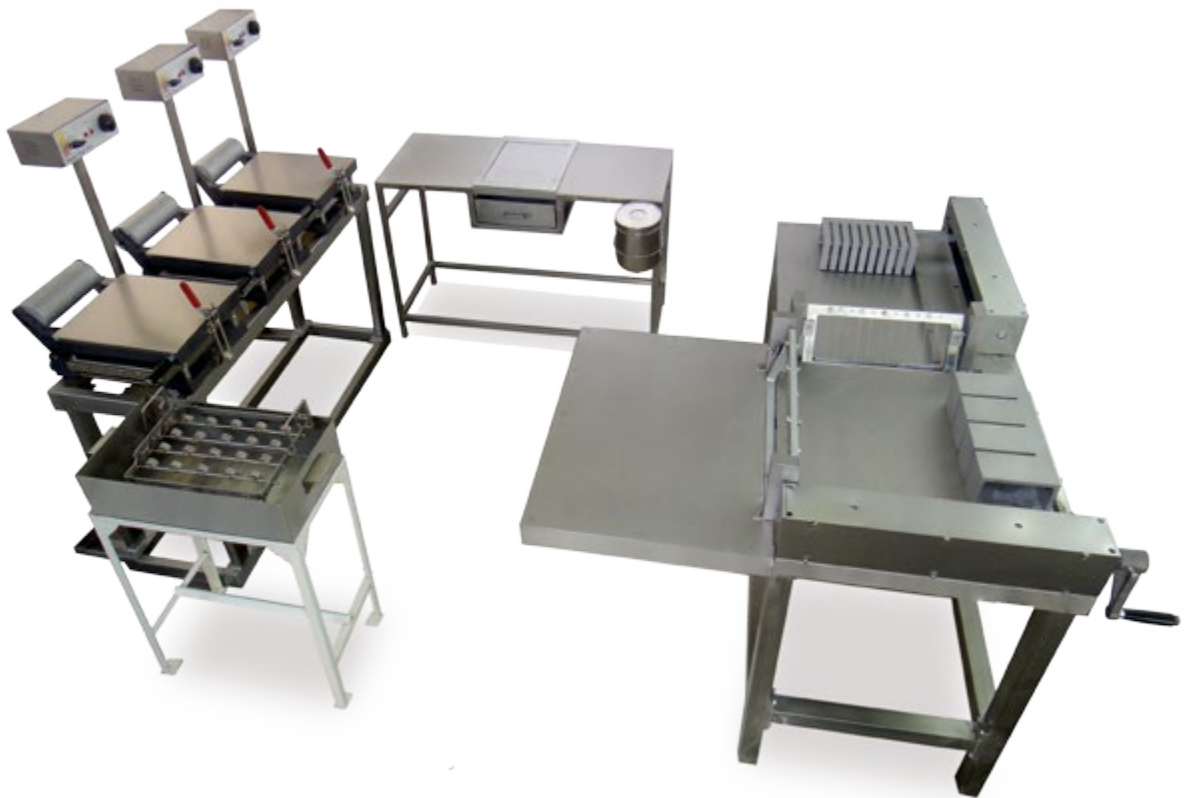
(WT - 3 Station Layout)