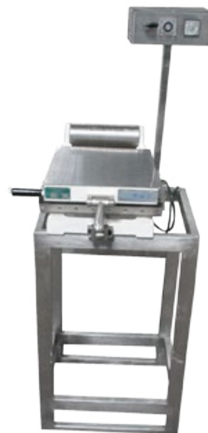
WT - 1 Lab Model