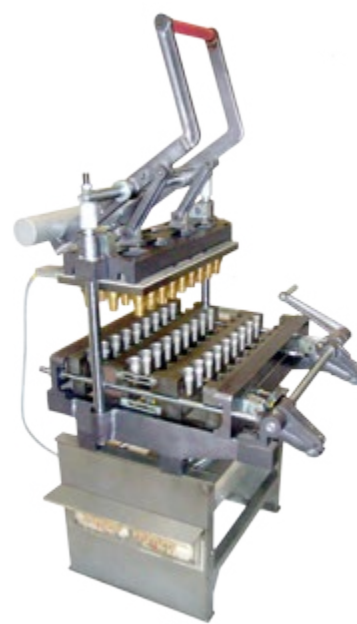
Special Edition-ZE 50 Plus

* The capacities indicated above are maximum values. The exact capacity depends on baking time, recipe and cone size etc.,